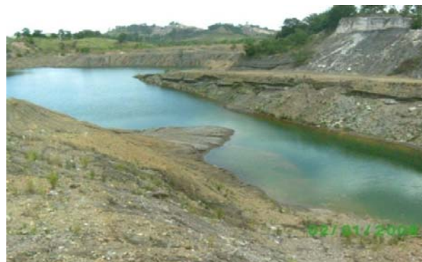
Figure 3. AMD pool appearance at Simpangempat Village.

Simpangempat was accumulated in pool approximately as large as 5000 m 2 . This mine water volume is estimated more than 25000 m 3 . The mining activities at this site still running, it means that mine water which will be produced much more so this AMD should be overcome.