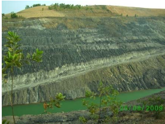
Figure 6. The out crop and overburden of mining at Tarungin Hill.

spottly distributed of calcopyrites. The weathered rocks usually show brownish red to reddish brown in color (Figure 6).