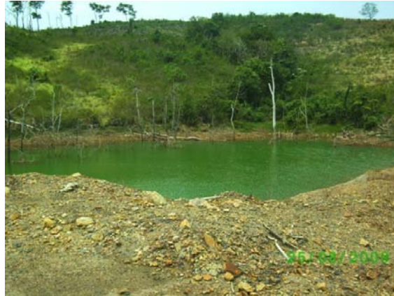
Figure 2. The storage pool of AMD at Tarungin Hill, has ± 2500 m 2 in size.

water volume is estimated more than 7500 m 3 and could be increase if there are heavy rainfalls. The mining activity still have run there, it means acid mine water will be produced much more than today.