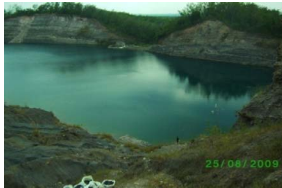
Figure 4. The pool of AMD located in Pakan Hill.